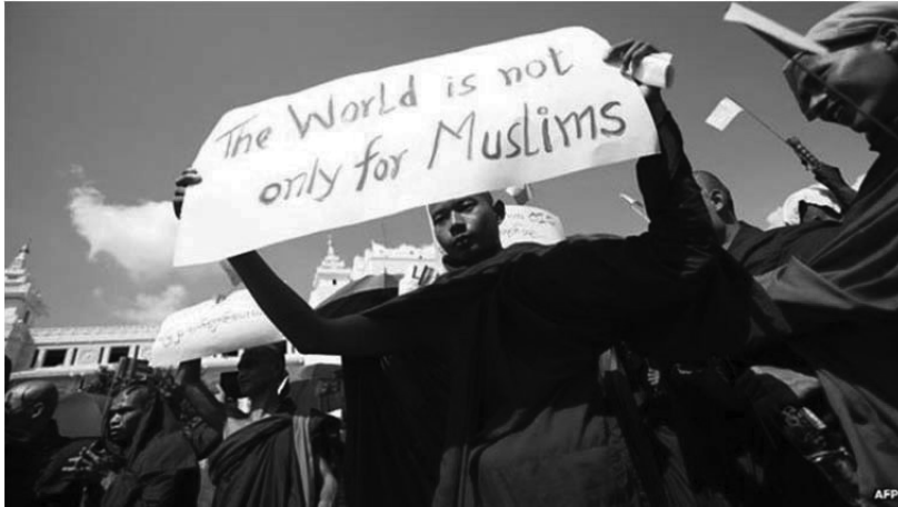
Figure 5 Myanmar Buddhist monks demonstrating in Yangon with anti-Muslim slogans.

Muslim is violence, radical, dangerous, exclusive society and fast growing population. Globally the fear of Muslim that flies around the world, not only in the Christian Western countries but also in Buddhist Sri Lanka and Myanmar.