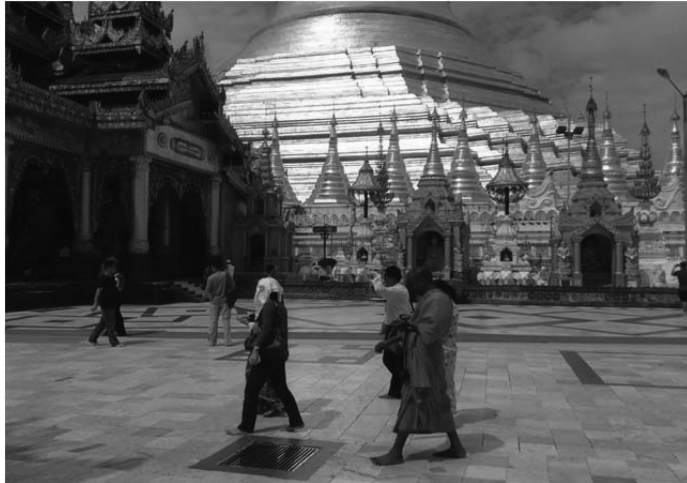
Figure 3 Shwe Dagon Pogoda in Yangon, Myanmar, 2013