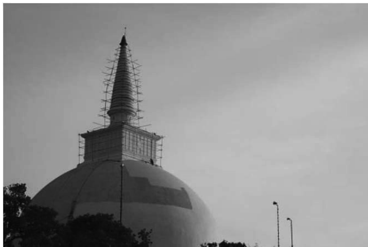
Figure 1 Maha Stupa Mihintale, where is commemorated the meeting between Maha Mahinda Thera (Thera is a title specially used for these reverend monks) and King Devanampiyatissa in a mango forest, which is always interpreted as the first moment of Theravada Buddhism's propagation on the island of Sri Lanka, 2015

These Dhammaduta reached various areas. Based on the teaching of the Lord Buddha, Buddhism with the forms of Mahayana Buddhism, Vajrayana Buddhism and