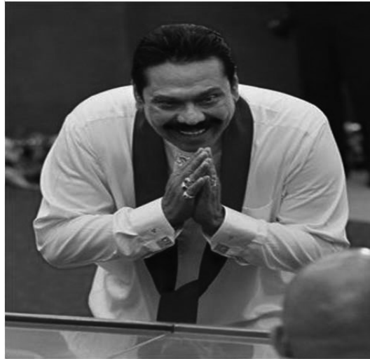
Figure 9 It is said that the former Sri Lankan president Rajapaksa had lots of connections with the Bodu Bala Sena

In a word, the twisted relationship between the government and Sangha worsens the situation. In the case of Myanmar, in 2007, ignoring the despotic power of Myanmar's military government, to the world's amazement, the monks led the Saffron Revolution against the government. Nevertheless, the author found some Sangha members chose to embrace the government after the quick opening up in 2013 and part of the Sangha has been used by the strong military power in Myanmar government for their political interests.