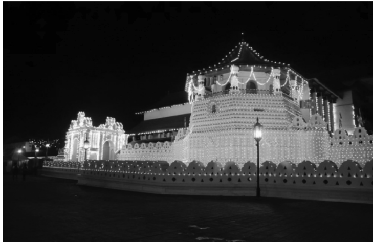
Figure 2 The Temple of the Tooth, Kandy, Sri Lanka, 2013

However, Theravada Buddhism in Sri Lanka experienced ups and downs throughout history. The Chola (a South Sub-continent based Tamil kingdom) invasion of Sri Lanka in the 10 th century brought Theravada Buddhism into darkness and during that period, the Hindu power pushed Buddhism into the margins. The number of Sanghas decreased dramatically. After Sinhala people regained power on the island, it was the Sanghas from Arakanese kingdom and the Rammana kingdom who saved the Sangha order in Sri Lanka. Then during the colonial era, when the Portuguese power first landed on this island, they considered themselves as the protector of the Holy Catholic faith and charged with propagating Catholicism around the world - this deed was approved and supported by the Holy See. When the Portuguese arrived in Sri Lanka, they gradually took control of the coastal area, and began to stop the popular practice of Buddhism by forcing monks to un-robe, destroying monasteries and preventing Buddhist activities. As a result, Buddhism was brought to a dangerous situation. This time with aid from Siam and Burma, the Sangha order was thus saved again.